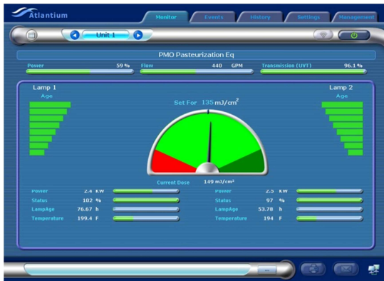
The monitor displays the status of real-time data, including actual dose delivered

Thanks to Atlantium's multi-disciplinary approach, its system accurately measures and controls UV using advanced algorithms, hydraulics, optic simulation and modeling tools for reliable, measurable disinfection.